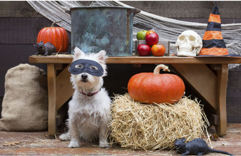
A dog ID tag is one way to ensure your lost dog comes home safely.

Whether you're interested in the tricks or the treats, Halloween is the perfect time for unleashing a little spooky fun. Dressing up, decorating and of course noshing on some sugary treats are just a few reasons why Halloween brings delight to the fall season. And if you love your dogs like I do — and want them to partake in anything enjoyable — it can be a great time to involve your pet and give him some special Halloween-ified attention.